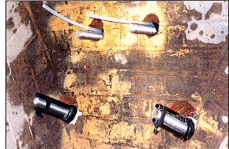
Shear anchors shown at the top and tension anchors at the bottom

As a result of the use of a CINTEC installation, disruption was reduced from 6 weeks to 2 days together with a 50% saving on the original budget Railtrack had allocated to the project.