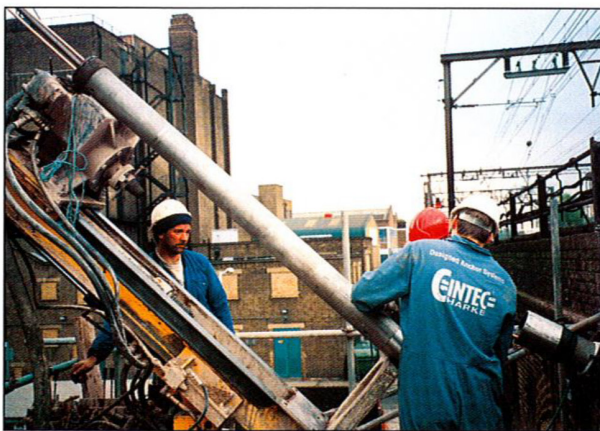
The assembling and installation of a compression anchor

A system was required to secure the gallows to the bridge arches; in their preliminary planning, Railtrack anticipated a shut down of the tracks for 6 weeks. Such a closure would mean a chaotic time table, irate passengers and a loss of revenue. The CINTEC Anchoring System proposal provided a solution that would require only 2 days of rail shut down.