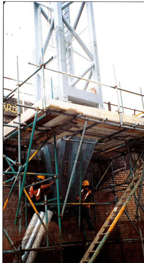
The torquing of the anchors