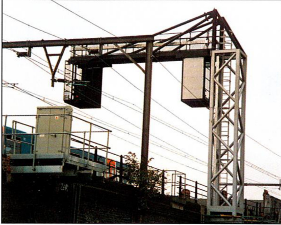
Cantilever Signal System