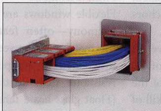
EZ-Path® MAX feeding multiple Standard EZ-Path® pathways.

New EZ-Path® MAX ...manages TWICE as many cables!