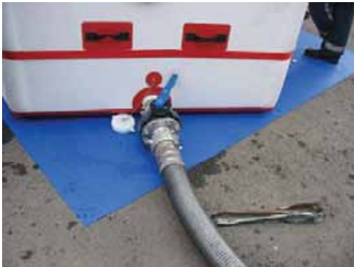
Attach suction hoses as required