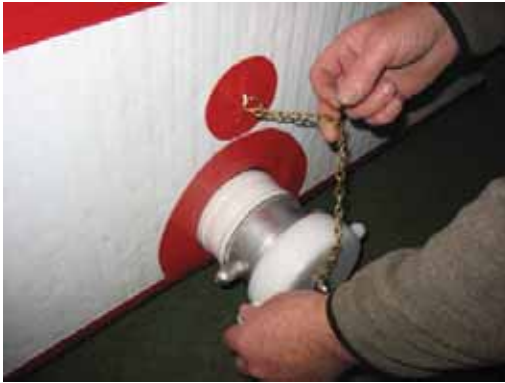
Unscrew protective caps from external male 4" fittings