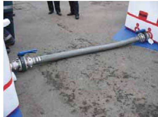
If two dams are to be deployed, join the two units with a short male-male suction hose