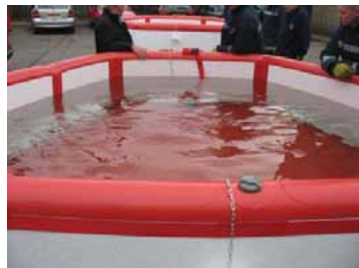
Open valves and fill dams