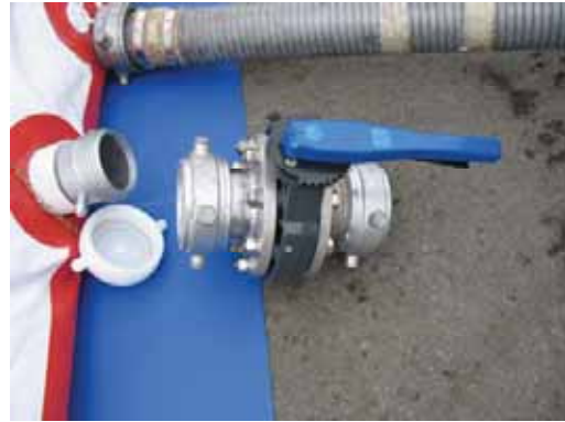
Attach 4" female butterfly valves To each side of dam